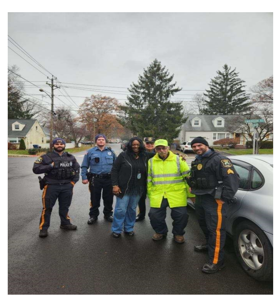
All School Crossing Guards were given letters of appreciation and gift cards to a local coffee shop to show them how much they are appreciated. * December 2022