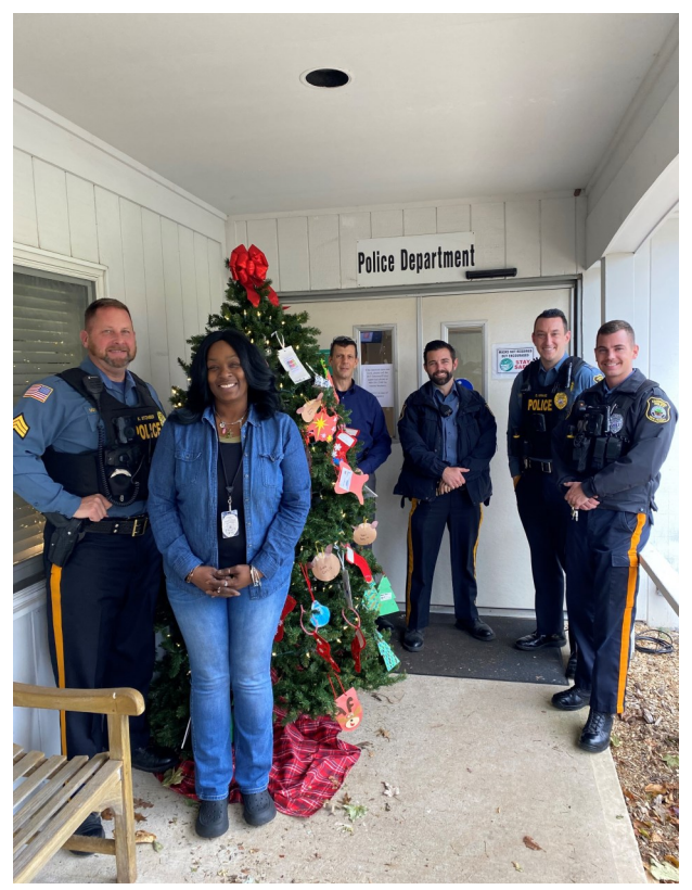
Fanwood Giving Tree

One officer and their spouse welcomed a baby boy