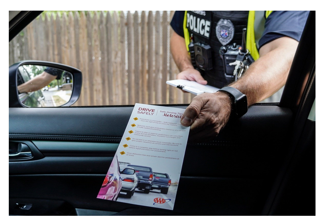
In June and August 2022, Fanwood Officers pulled over more than 185 motorists for failing to yield to pedestrians that were in the crosswalk. While several summons were issued, the primary goal was to educate drivers on pedestrian safety laws.